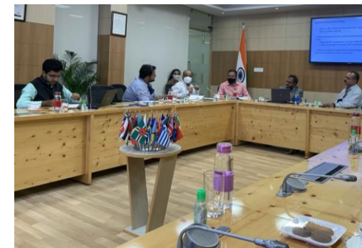
BSF IG Kashmir Meeting with BBNL