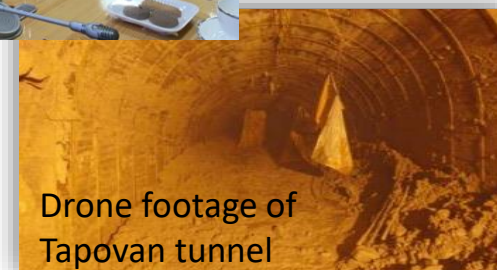
Drone footage of Tapovan tunnel