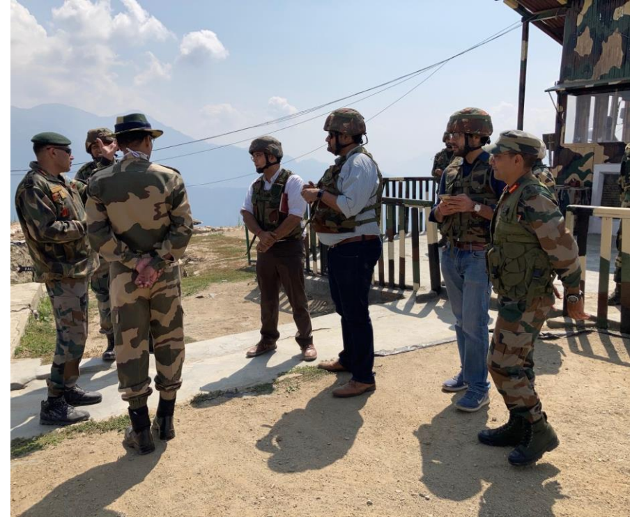
BSF Bn172 TachHQ Balbir Point, Sector Kupwara, Frontier Kashmir 25 Aug 2021