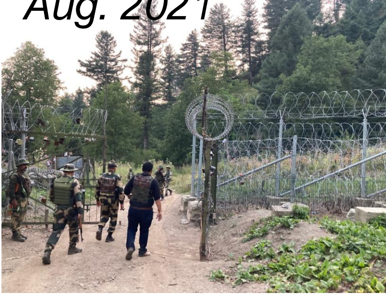
BSF 91Bn TachHQ Peer Baba. Sector Baramulla. Line of Control. Frontier Kashmir. 23 Aug 2021